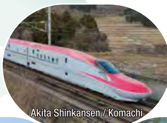
Akita Shinkansen / Komachi