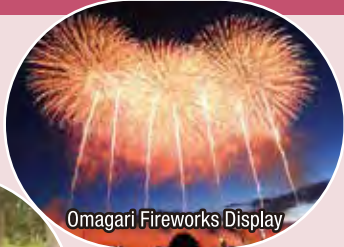
Omagari Fireworks Display