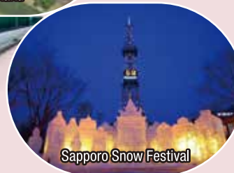
Sapporo Snow Festival