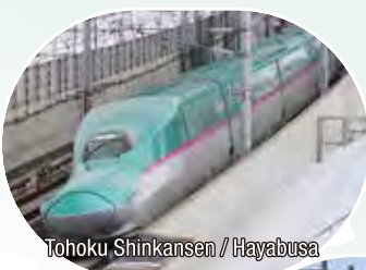
Tohoku Shinkansen / Hayabusa