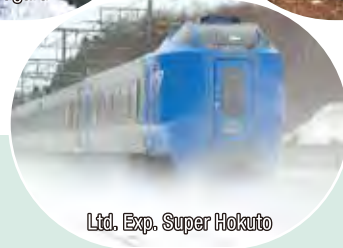
Ltd. Exp. Super Hokuto