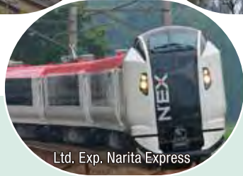
Ltd. Exp. Narita Express