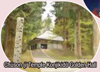
Chūson-ji Temple Konjikiō Golden Hall