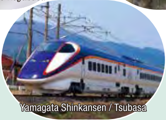
Yamagata Shinkansen / Tsubasa