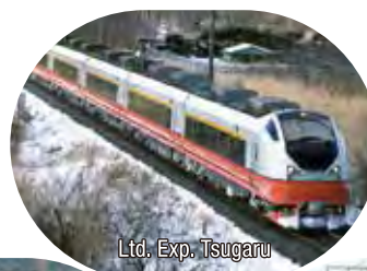
Ltd. Exp. Tsugaru